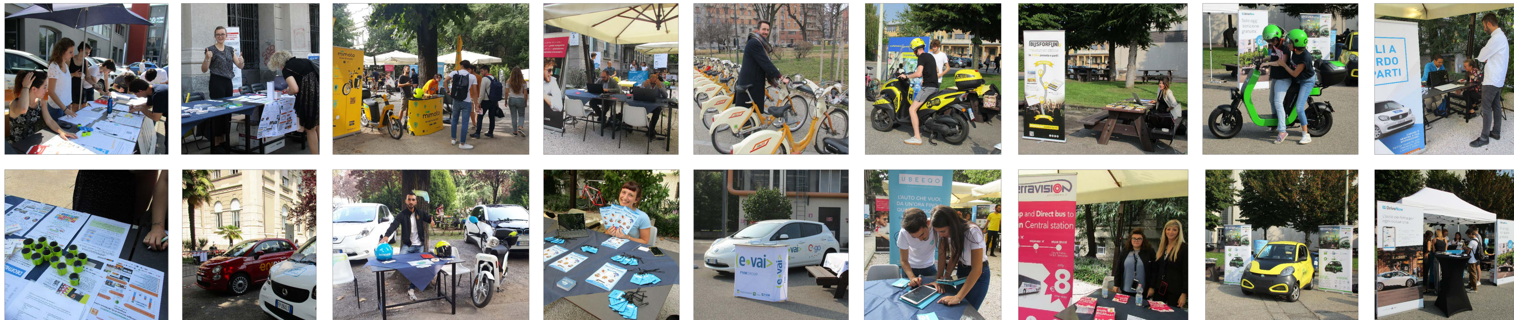
Figure 2: Initiatives on campus to promote sustainable mobility.