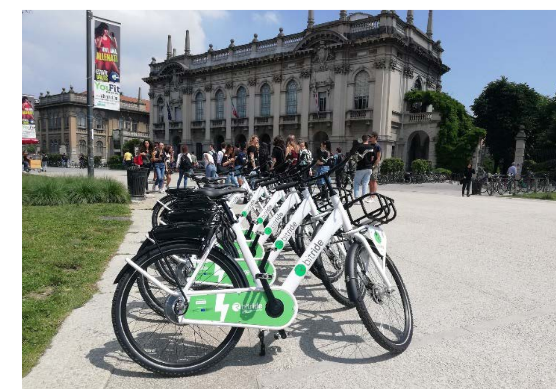
Figure 3: The hybrid-floating bike sharing service tested on campus.