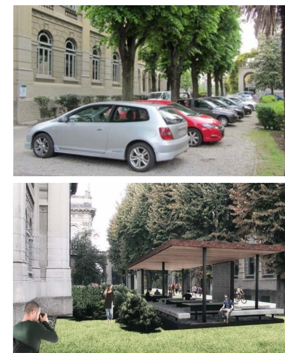
Figure 1: The Leonardo Campus before (above) and after (below) the Vivi.Polimi renewal.

Meanwhile, our main campuses are currently undergoing a renewal process, thanks to the projects by Renzo Piano and VIVI.POLIMI, which will also reduce parking spaces on campus to further discourage the use of private cars.